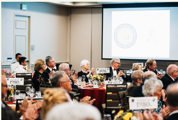
1970s and 1980s graduates of the Trojan Battalion