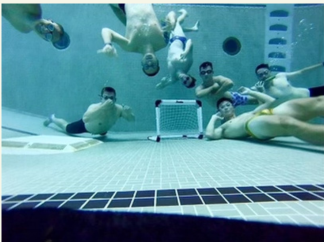
Underwater Torpedo Club members during practice