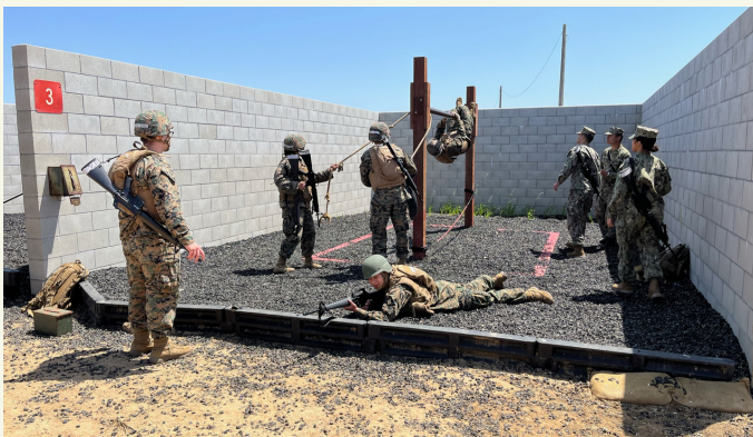
Midshipmen attempting a Leadership Reaction Course

This semester, participating in the FEX at Camp Pendleton proved to be a valuable experience for both myself and my peers. As 1/C, my class focused on developing and evaluating the 4/C's abilities as competent followers and leaders of small units. While our designated role leading up to this FEX was to be that of the "teacher," I found that I learned a great deal through instructing the younger class and evaluating the training that they had been taught throughout the year. The opportunity allowed me to enhance my existing skills and improve my proficiency to a higher level.