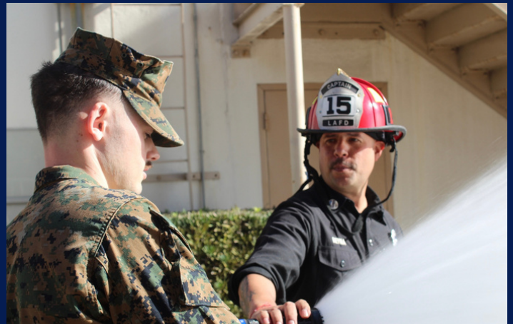
Top: MIDN Getting hands on experience with the fire hose Bottom: LAFD Personnel dressed out for their live demonstration