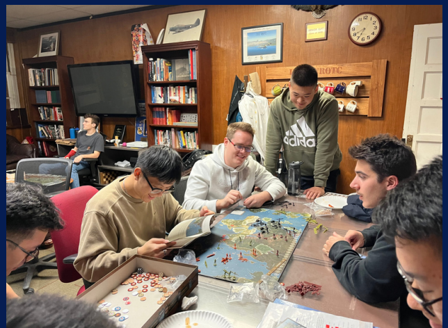
Wargaming members gathered in the wardroom for their third meeting