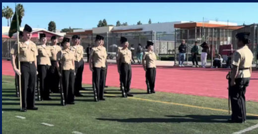
Top: Chaparral High School Cadets Preparing for their Armed Field Exhibition