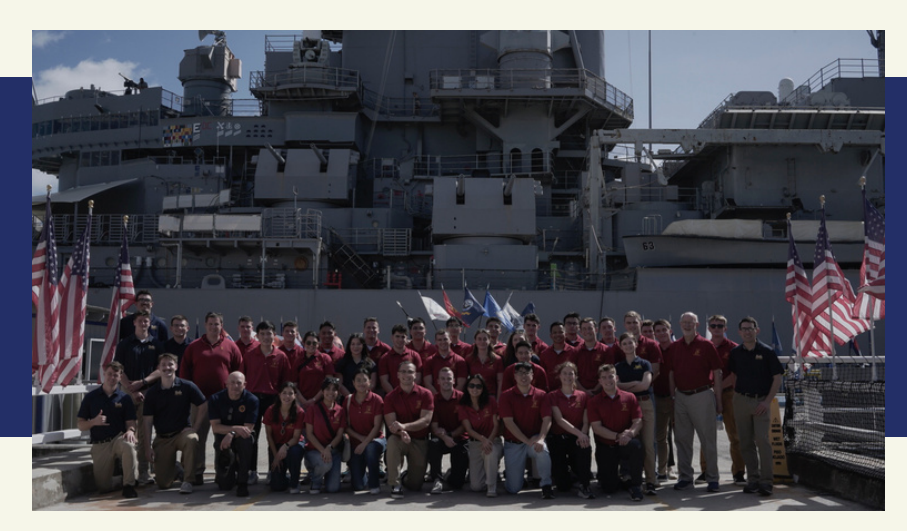
1/C Midshipmen and Staff Outside of the USS Missouri