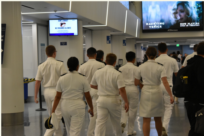
Midshipmen arriving at Los Angeles International Airport

Honor Flight Southland disembarked on one of their many journeys on the 15th-17th of September to the nation's capital for a weekend of remembrance. The mission of the organization is to honor the veterans by offering the opportunity to commemorate their service and pay respect to their fellow men and women who made the ultimate sacrifice. At the heart of the trip are the war monuments where veterans of World War II, the Korean War, and the Vietnam War can come together to share their stories. For many of the veterans, this journey is their final opportunity to visit the memorials dedicated to their war.