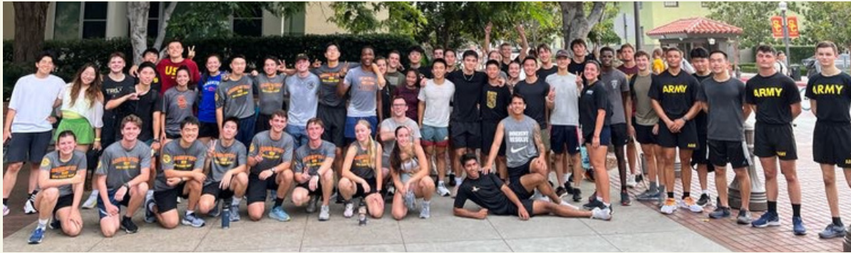
Participants of the 9/11 Memorial Stair Climb

In the twenty two years inside the attacks on 9/11 our world has changed dramatically. What it means to “Never Forget” has taken on a different meaning as the raw emotion of these events has become a monument of our past. For the Trojan battalion, where the majority of Midshipmen had not even been born yet on 9/11, Never Forgetting means doing what we can to honor the memory of those who gave the ultimate sacrifice.