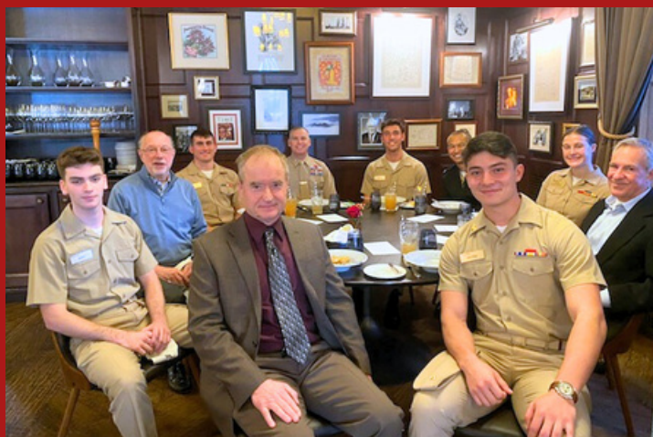
Lunch with the Alumni League