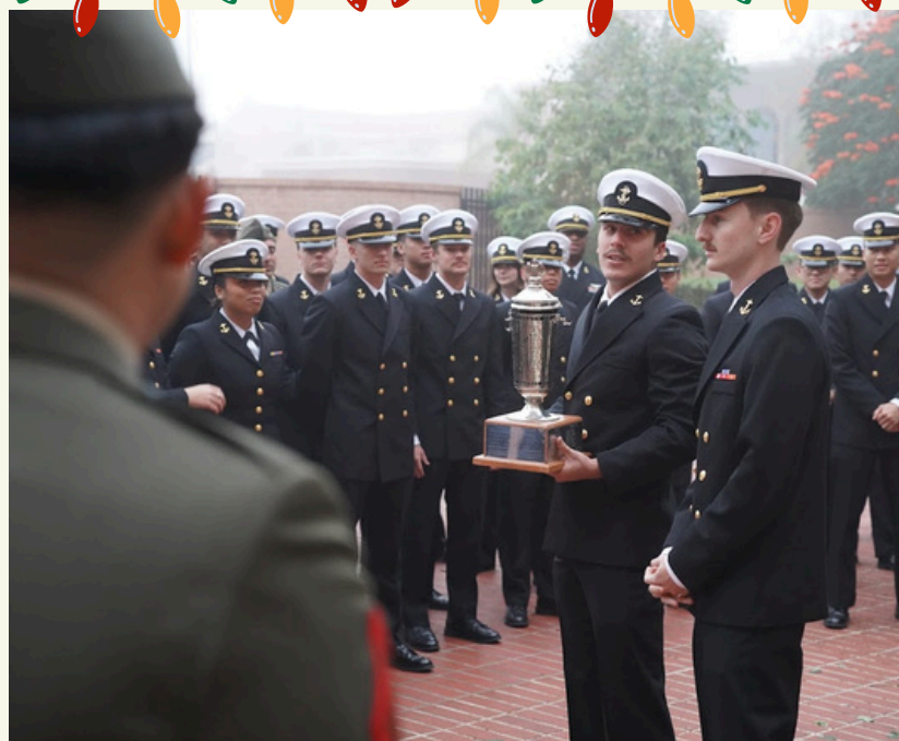
Operations Platoon's Leadership receiving the trophy

The coveted Golden Canteen represents the culmination of a semester-long competition that evaluates each platoon's performance across various events and metrics such as academic performance, physical fitness, and inter-platoon sporting events, to name a few. Throughout the semester, this platoon has demonstrated excellence in many of these areas. They dominated the competitions during the Battalion Beach Day, obtained the best initial PRT/PFT scores, earned the highest midterm GPA, won the Halloween dodgeball tournament, the 1st Squad Competition, achieved the highest scores on the weapons simulator, and finally ended it on the drill pad by winning the Platoon Drill Competition. The winner of this semester's Golden Canteen is Operations Platoon.